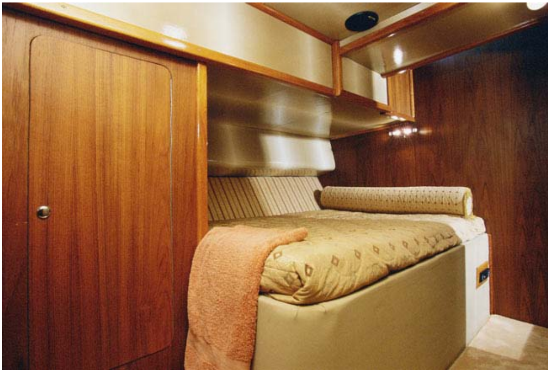
The yacht has Internet Connection and is completely Air Conditioned.